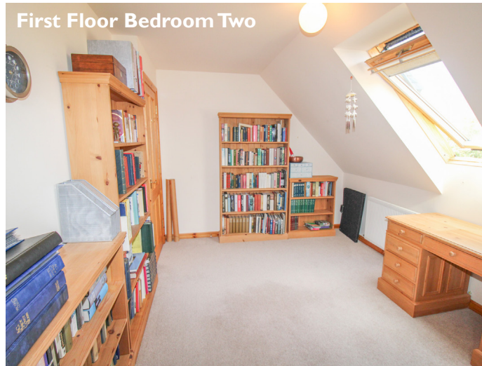
First Floor Bedroom Two