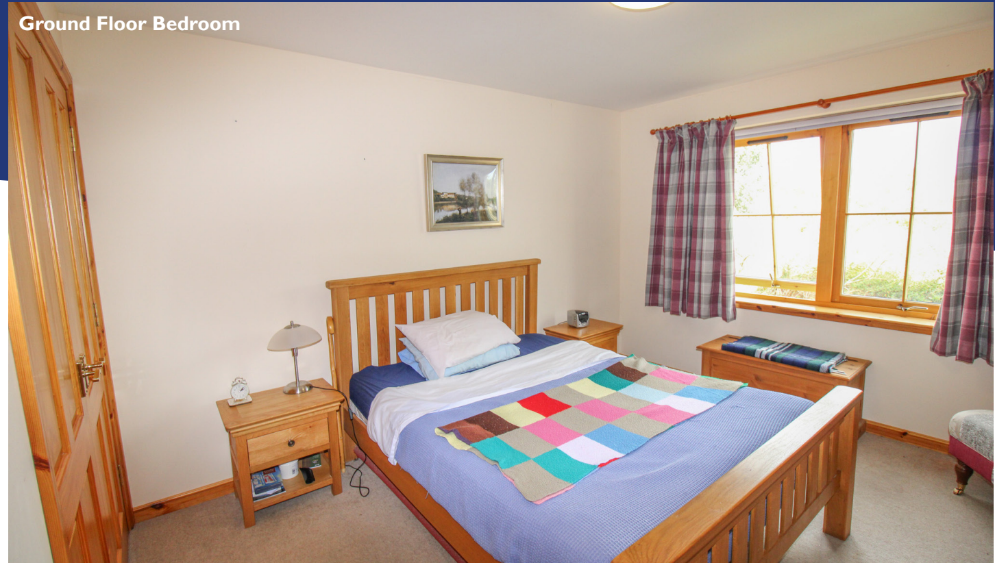
Ground Floor Bedroom